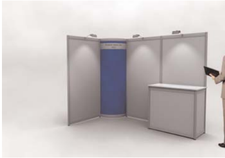
18 STANDS 2 X 1 PANELS (1-9, 11,12,13,14-20)