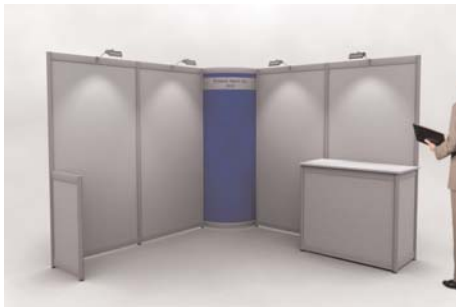
2 STANDS 2 X 2 PANELS(10,13) option to also merge 18 & 19